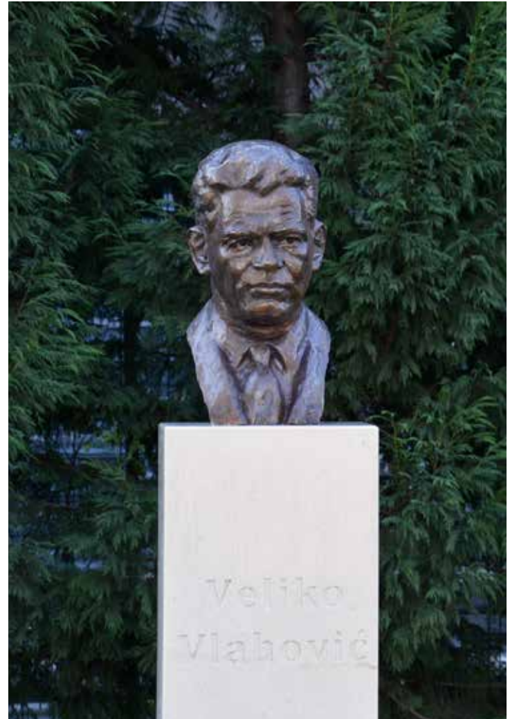
Bust of Veljko Vlahović which is placed in the campus of the University of Montenegro in 2016.

The Study year is organised in two semesters (Winter and Summer). The time spent on a Study programme in one semester is 15 weeks.