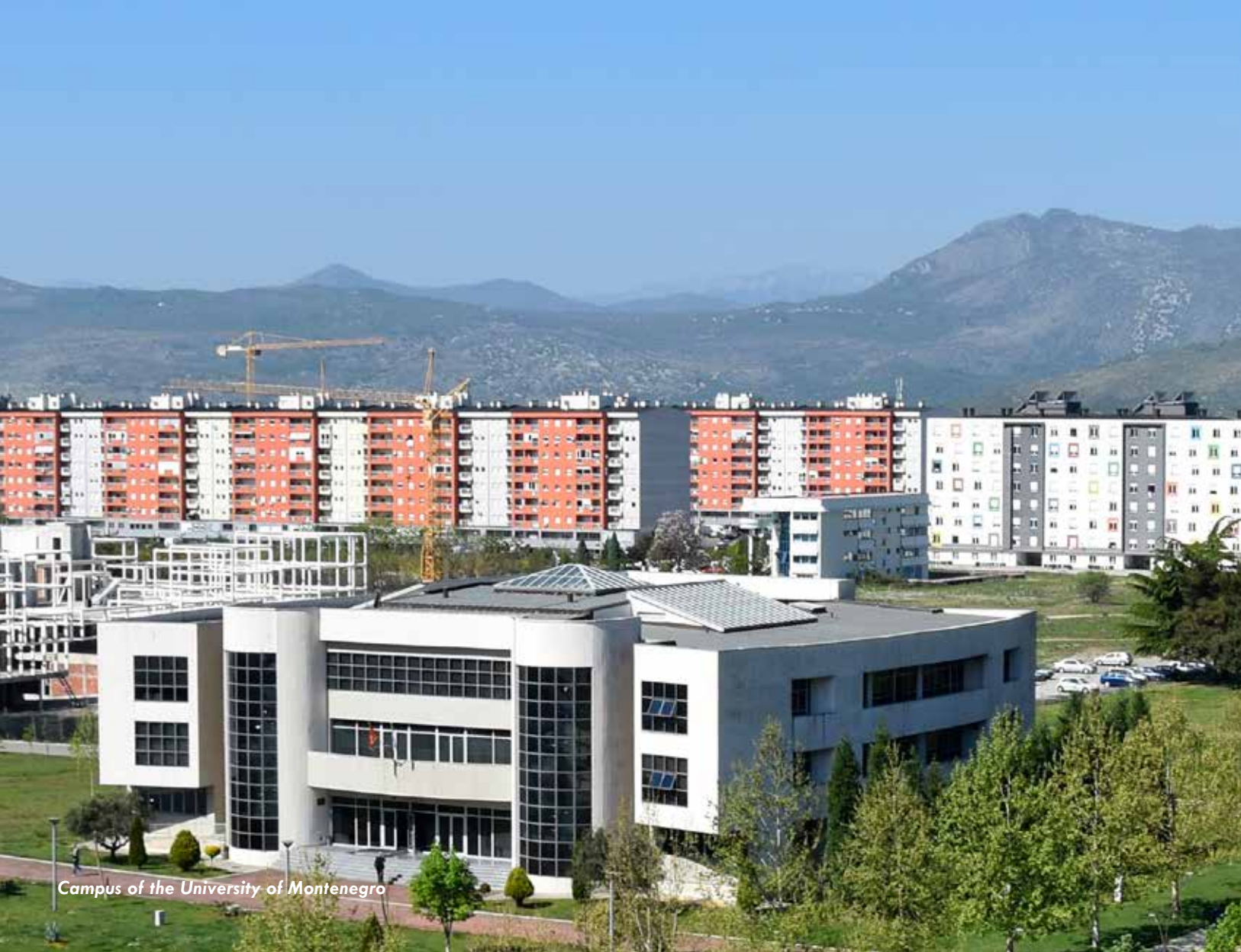
Campus of the University of Montenegro